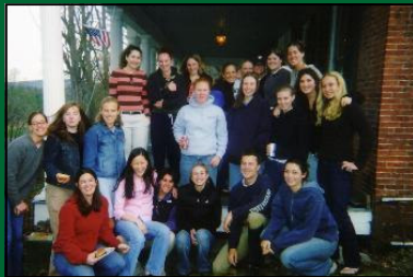
University of Vermont Equestrian Team End of Year Picnic